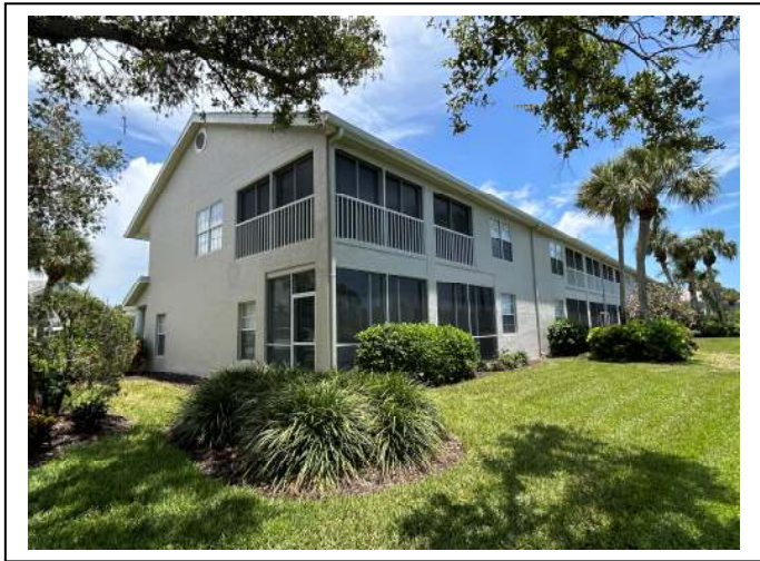
REAR ELEVATION VIEW