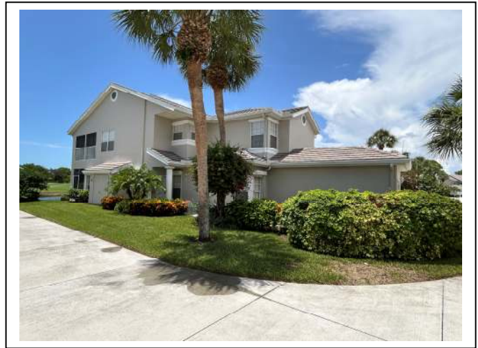
SIDE ELEVATION VIEW

Bermuda Greens Condominium Association 13055 Castle Harbour Drive, Naples, FL 34110 06-10-2025