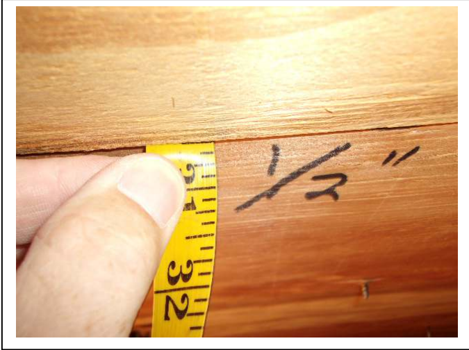
ROOF DECK THICKNESS – 15/32 to 1/2 inch plywood

R3 Inspections, LLC P.O. Box 152205 Cape Coral, FL 33915 Office: 239.810.7793 Email: radjrsas@yahoo.com