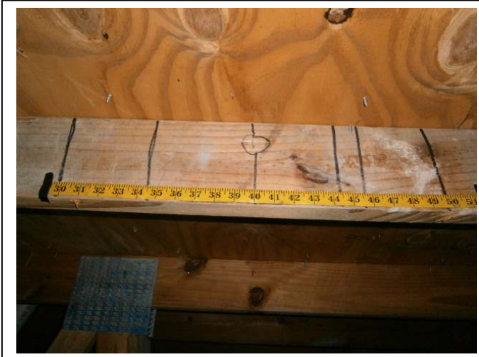
ROOF DECK ATTACHMENT – 8d nails within 6 inches along the edge