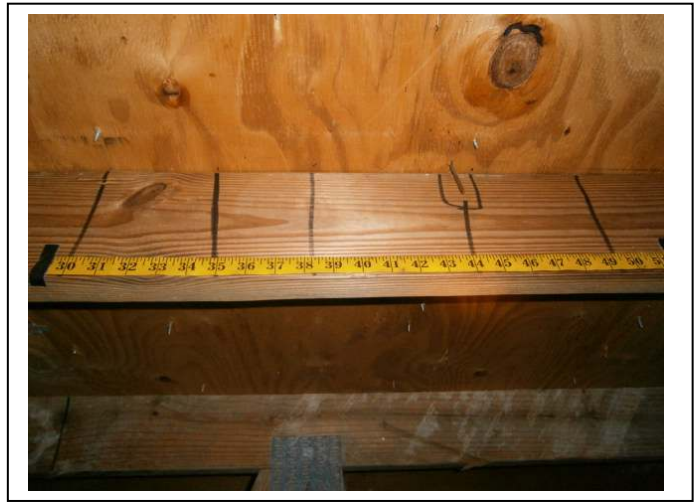
ROOF DECK ATTACHMENT – 8d nails within 6 inches in the field