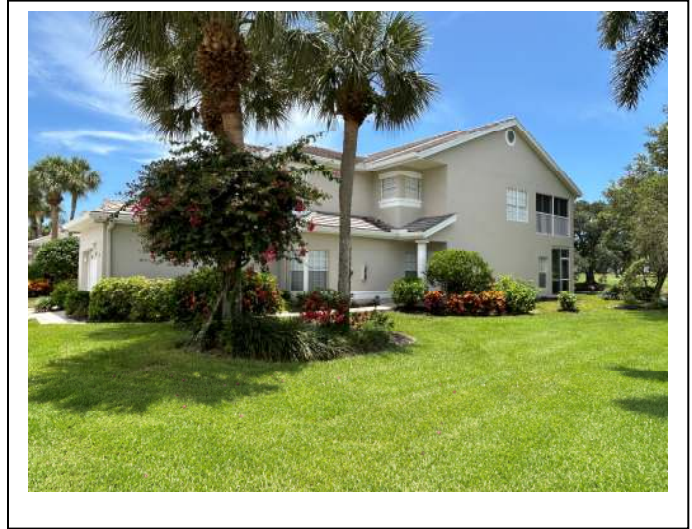
SIDE ELEVATION VIEW