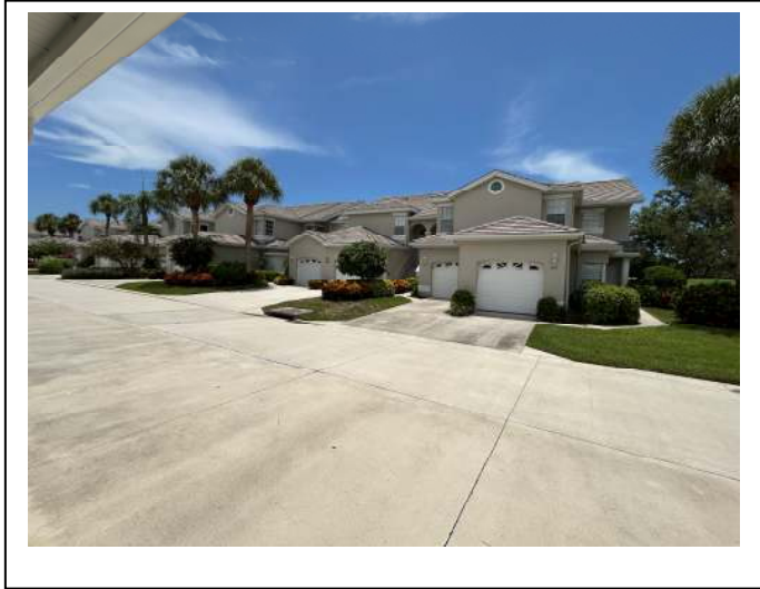
FRONT ELEVATION VIEW

R3 Inspections, LLC P.O. Box 152205 Cape Coral, FL 33915 Office: 239.810.7793 Email: radjrsas@yahoo.com