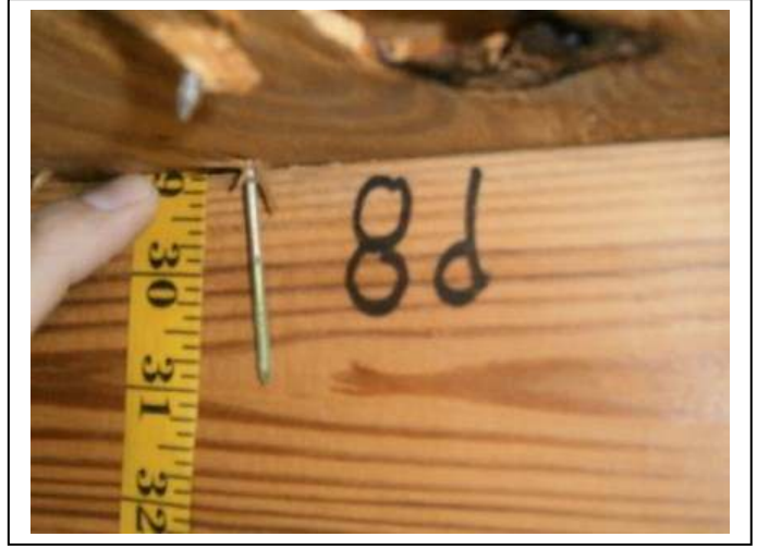
ROOF DECK ATTACHMENT – 8d ring shank nails added in 2014